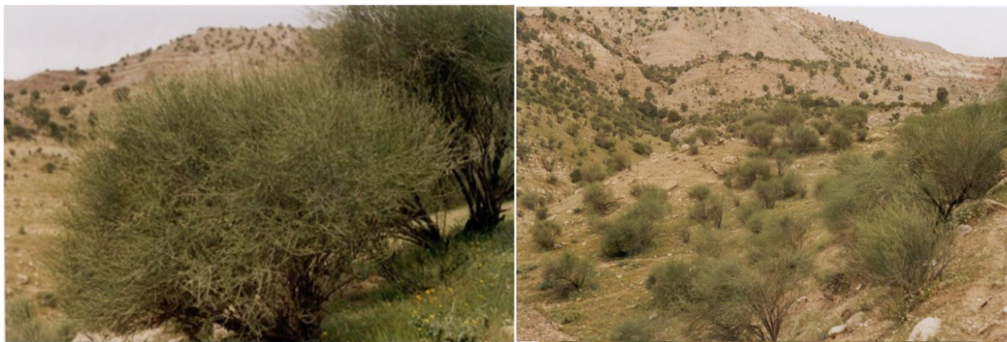
Img2. individuals and stand of A. arabica in Zarinabad, Ilam